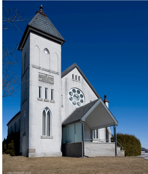
Free Reformed Church Of Oxford County 284799 Pleasant Valley Rd